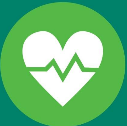
HEART DISEASE & STROKE