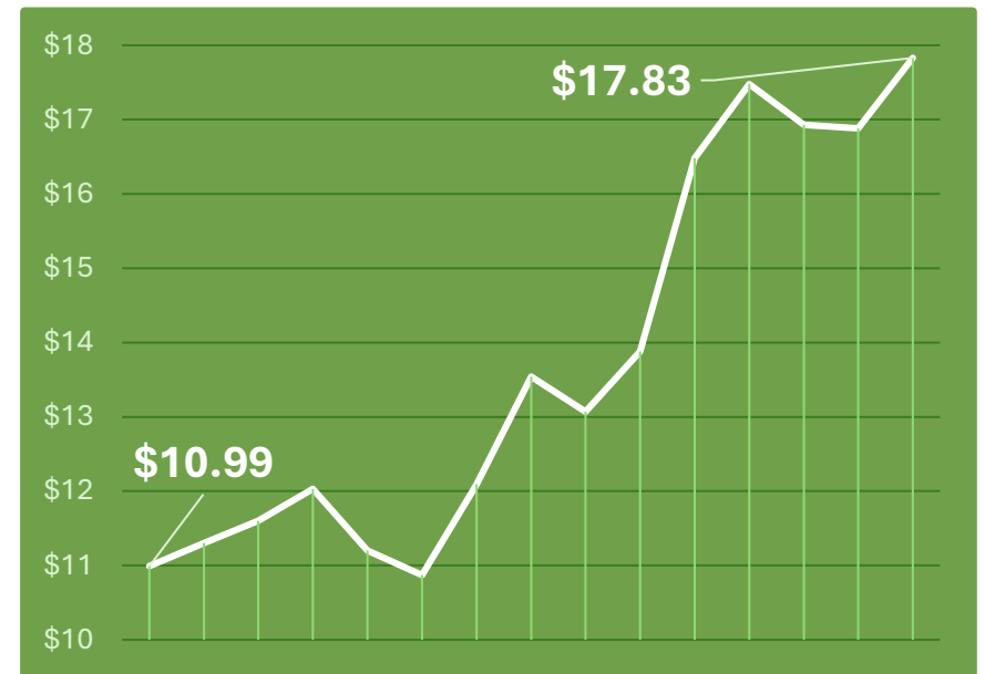
12-MONTH END 2012 - 2025 (in billions)