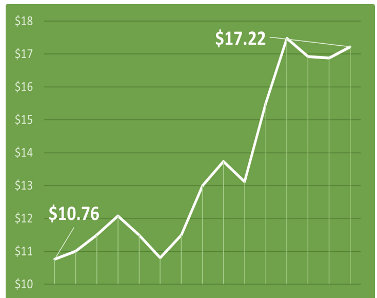
12-MONTH END 2012 - 2025 (in billions)