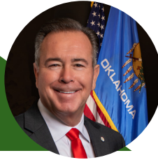
STATE TREASURER TODD RUSS

“January reflects moderation following December’s peak, with state revenues remaining stable on a rolling annual basis. While growth has leveled off, underlying trends point to stabilization rather than reversal as Oklahoma begins 2026.”