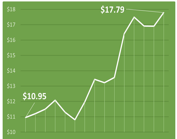
12-MONTH END 2012 - 2025 (in billions)