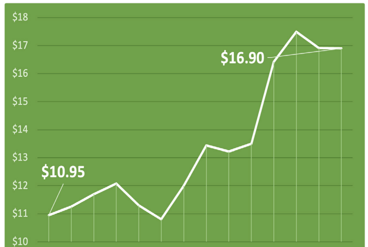
12-MONTH END 2012 - 2024 (in billions)