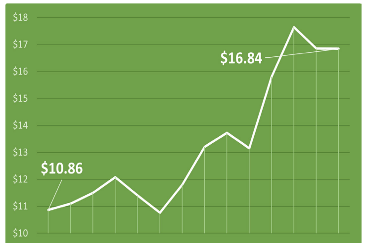
12-MONTH END 2012 - 2024 (in billions)