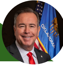
STATE TREASURER TODD RUSS

"Ending 2025 with a strong rebound, some indicators point to cooling business activity the broader revenue picture remains steady. As we begin 2026, these results reinforce the importance of monitoring short-term shifts while keeping focus on Oklahoma's long-term fiscal stability."