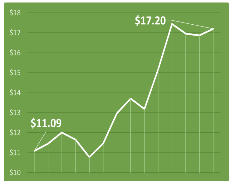
12-MONTH END 2012 - 2025 (in billions)