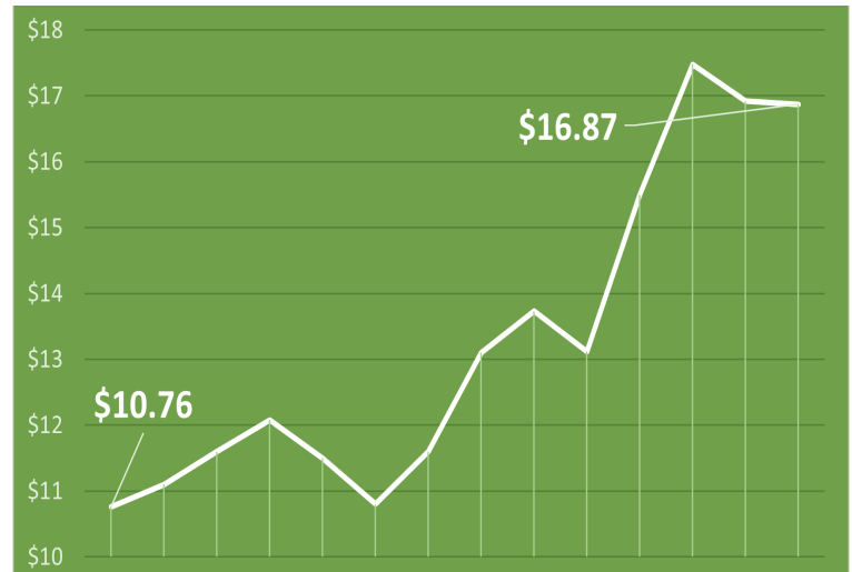
12-MONTH END 2012 - 2024 (in billions)