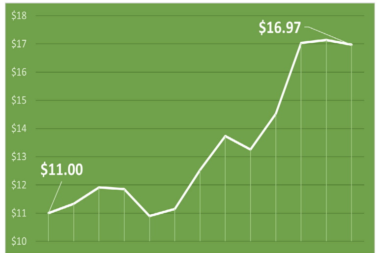
12-MONTH END 2012 - 2024 (in billions)

Gross Production Tax or "GPT" totals equal $85.4M , up $1.5M or 1.81% over the previous month. Other tax sources for the same time period show total income tax increased 63.6% , total sales and use tax decreased 2.3% , motor vehicle tax decreased 4.8% and other sources increased 0.7% .