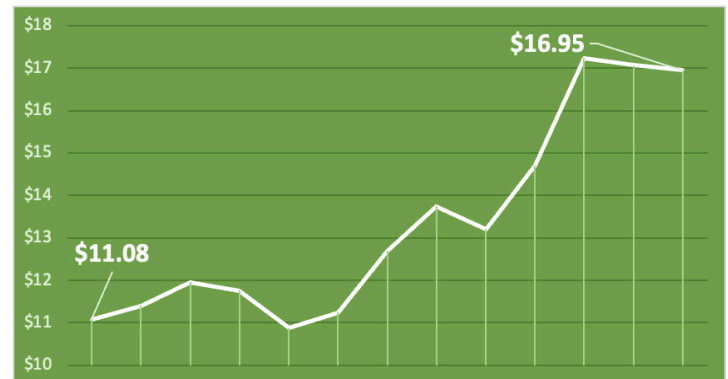
12-MONTH END 2012 - 2024 (in billions)

Gross Production Tax or "GPT" totals equal $73.3M , down $12.1M or 14.2% over the previous month. Other tax sources for the same time period show individual income tax increased 16.3% , total sales and use tax decreased 7.7% , motor vehicle tax increased 1.7% and other sources increased 9.9% .