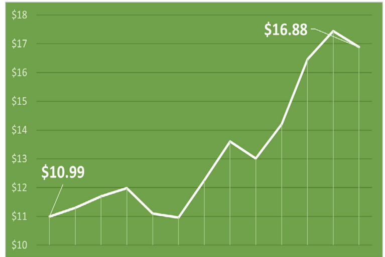
12-MONTH END 2012 - 2024 (in billions)

Gross Production Tax or "GPT" totaled $1.1B , down $734.2M or 40% for the same twelve month period. In contrast, total income tax increased 1.9% , total sales and use tax increased 1.1% and motor vehicle tax increased 1.8% .