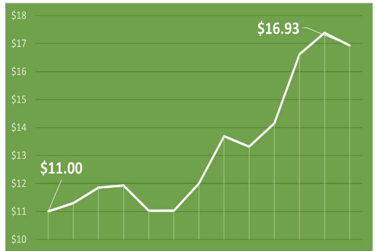
12-MONTH END 2012 - 2024 (in billions)

Gross Production Tax or "GPT" totals equal $1.1B , down $639.9M or 37% for the last 12 months. In contrast, total income tax increased 2.4% , total sales and use tax increased 0.5% and motor vehicle tax increased 2.7% for the same period while other sources show a decrease of 1.1% .