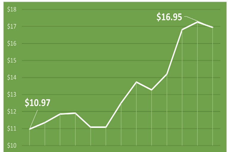
12-MONTH END 2012 - 2024 (in billions)

Gross Production Tax or "GPT" totals equal $83.9M , up $1.6M or 2% over the last August. All other tax sources show an increase for the same time period, total income tax increased 0.2% , total sales and use tax increased 1.4% , motor vehicle tax increased 5.7% and other sources increased 7% .