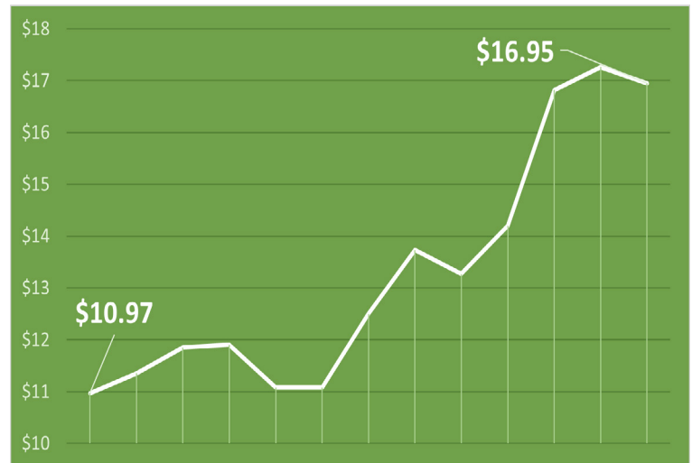
12-MONTH END 2012 - 2024 (in billions)

Gross Production Tax or "GPT" totals equal $83.9M , up $1.6M or 2% over the last August. All other tax sources show an increase for the same time period, total income tax increased 0.2% , total sales and use tax increased 1.4% , motor vehicle tax increased 5.7% and other sources increased 7% .