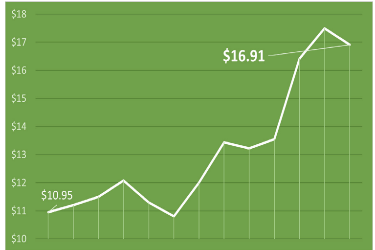
12-MONTH END 2012 - 2024 (in billions)

Receipts for the last 12 months through April total $16.91B , a decrease of $584.6M , or 3.3% , when comparing revenue from the previous year. Gross Production Tax or "GPT" decreased $853.3M , or 43.2% for the same twelve month period. In contrast, sales and use tax increased 1.6% , total income tax increased 2.6% and motor vehicle tax increased 3.2% .