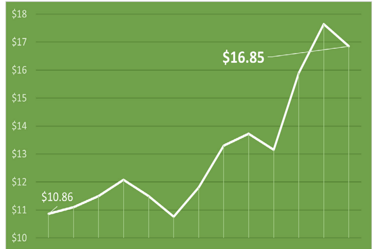
12-MONTH END 2012 - 2024 (in billions)

Receipts for the last 12 months through March total $16.85 billion , a decrease of $787 million , or 4.5% , when comparing revenue from the previous year. Gross Production Tax or "GPT" decreased $901.2 million , or 44.6% for the same twelve month period. In contrast, sales and use tax increased 2.1% .