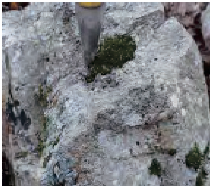
Original Stone Located and