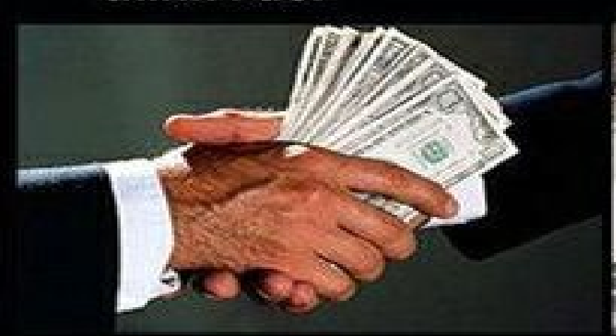
What society thinks I do.