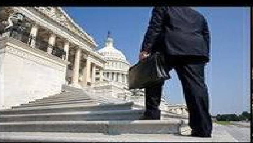
What I think I do.