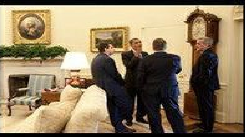
What my parents think I do.