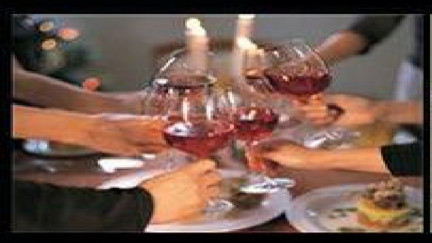
What my friends think I do.