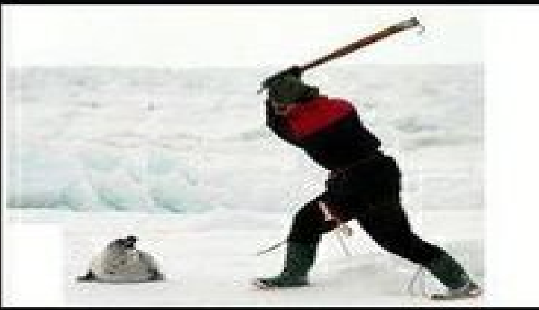
What the other side says I do.