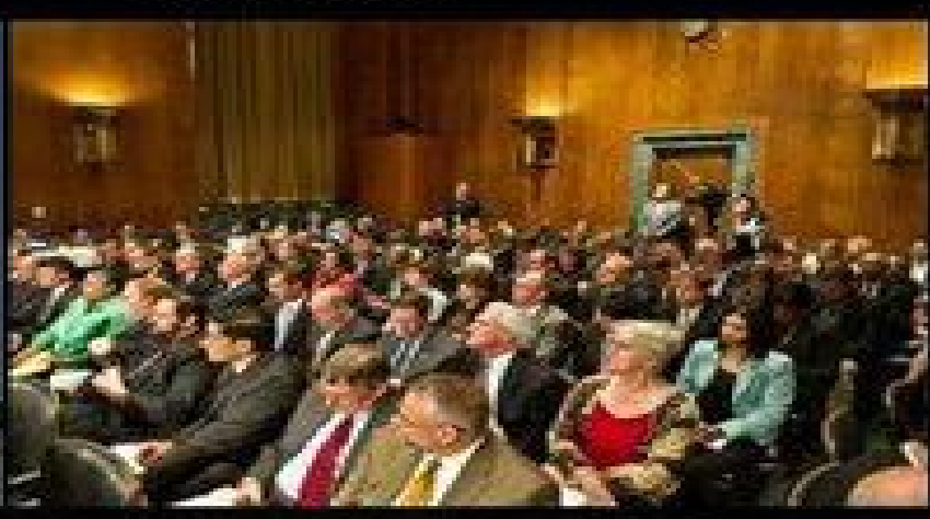
What I actually do.