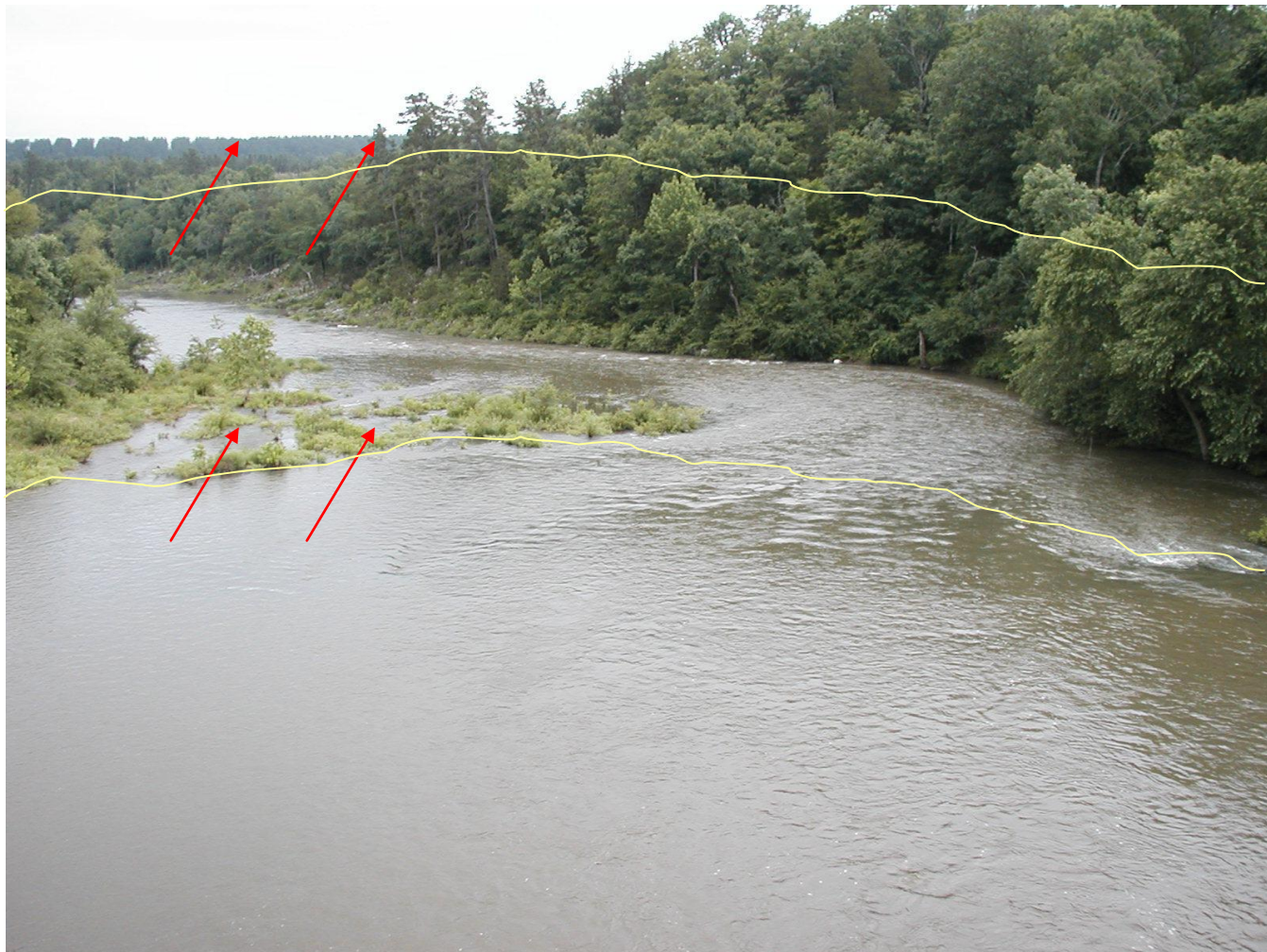
Figure 2. Medium Water Control

High Water Controls. The HWC governs the stage discharge relationship when the water extends past the MWC. The actual HWC is the floodplain of the waterbody.