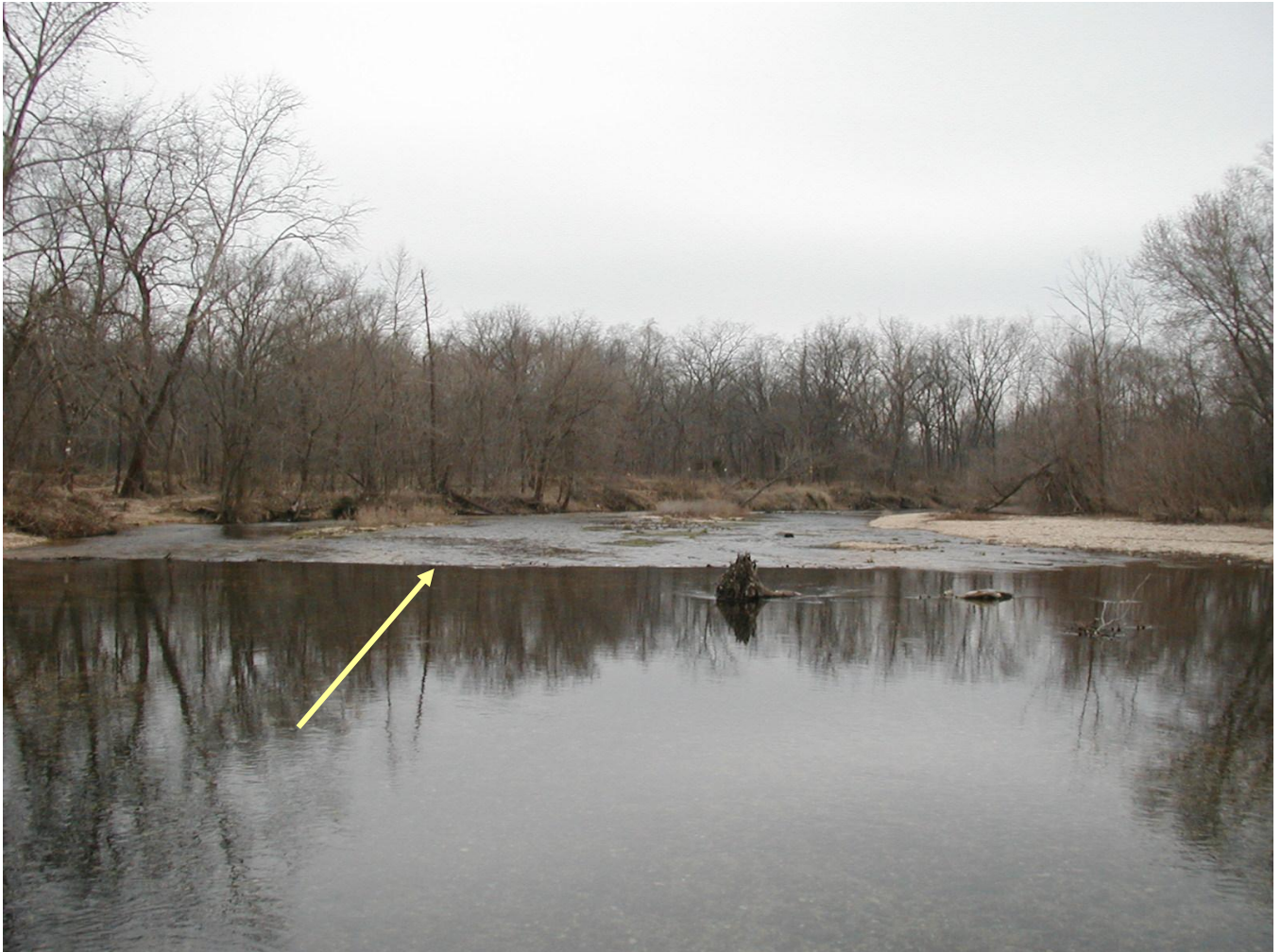
Figure 1. Low Water Control

Low Water Controls. An LWC governs the stage discharge relationship at low water. Figure 1 is an example of a rock dam controlling the upstream pool elevation.