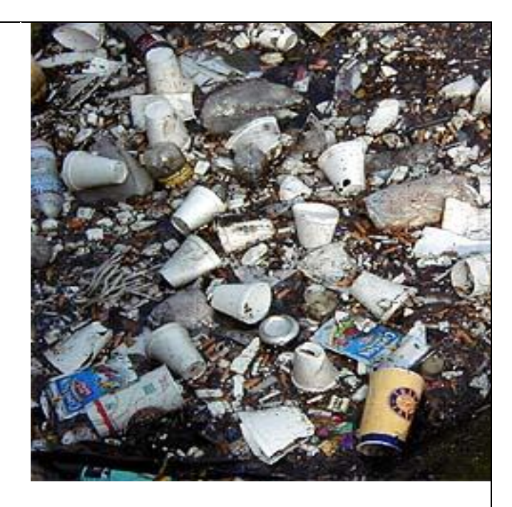
Litter in storm water systems impacts people, animals, fish, and plants.

For more stormwater pollution prevention tips, see the Oklahoma Turnpike Authority Stormwater page at: