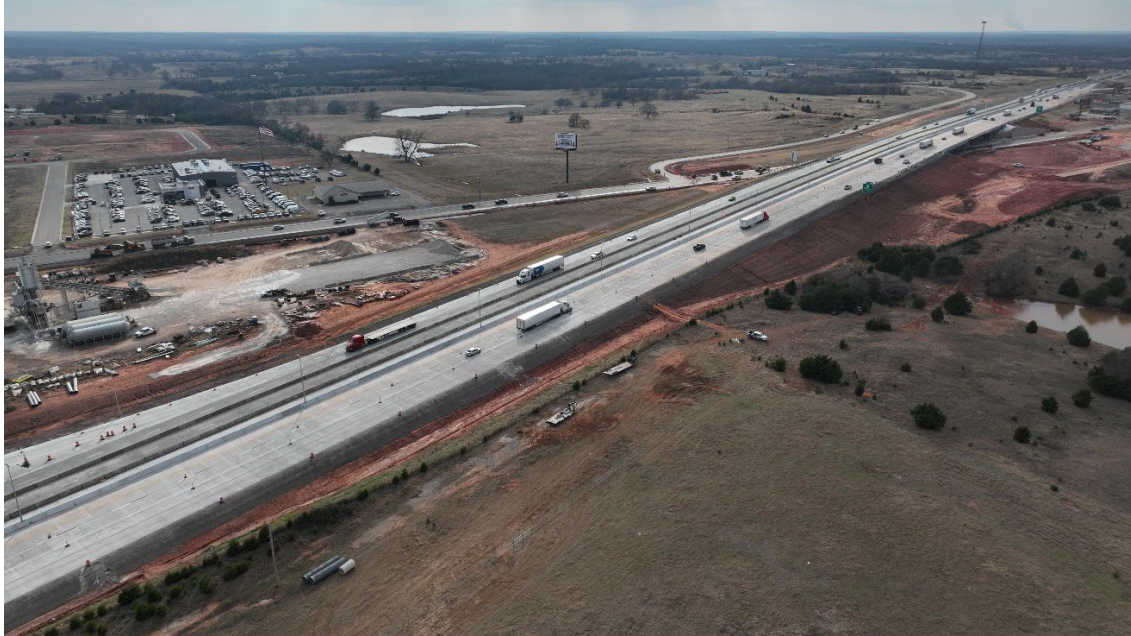
This aerial view shows the newly reconstructed I-44/Turner Turnpike bridges over SH-66 in Wellston. Turner Turnpike traffic is now off the detour and back on mainline lanes.

“Most people might not know this, but Wellston is very near the midpoint of Route 66 in Oklahoma, so we’re going to try to highlight that with the artwork (near) the bridge,” Echelle said.