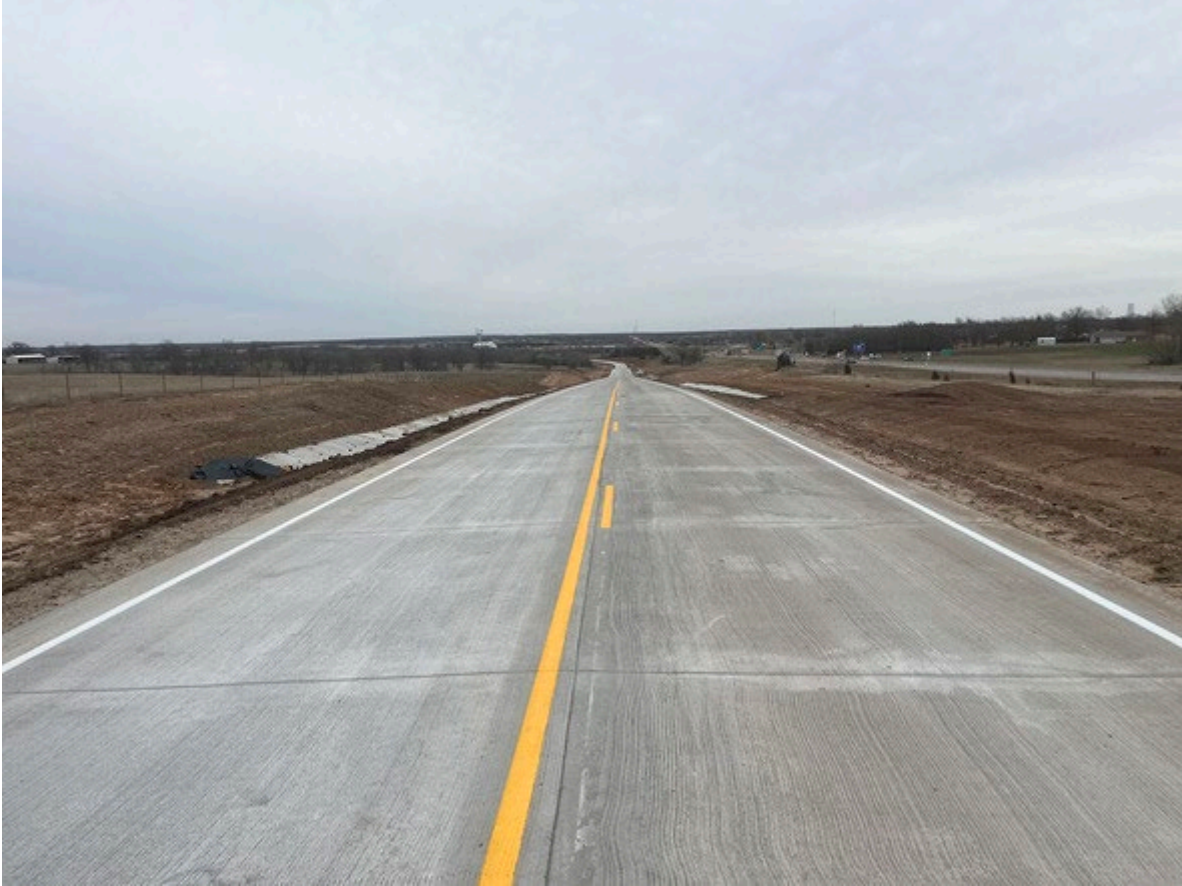
The new, two-way frontage road on the north side of the I-44/Turner Turnpike connects SH-99/Eighth Ave. in Stroud with Old Stroud Rd./N. 3550 Rd. and will open to traffic today.