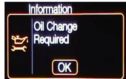
Ford Focus, Escape, Fusion (5w20)