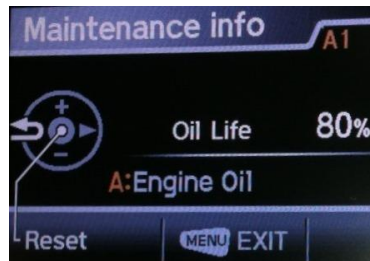
Honda Civic (0w20)