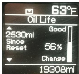
RAM/Caravan (5w30 / 5w20)