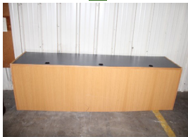
Multi-station desk (96" W x 29" D x 24" H)

Questions? Contact rebecca.watson@omes.ok.gov .