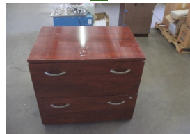
Two-drawer metal and wood lateral file cabinet (36" W x 26" D x 24" H)