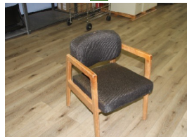
Lot of 10 stationary chairs