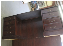
Wood desk with hutch (72" W x 79" D x 20" H)