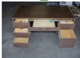
Six-drawer desk (61" W x 32" D x 30" H)