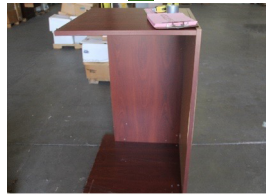
Wood desk (48" W x 30" D x 30" H)