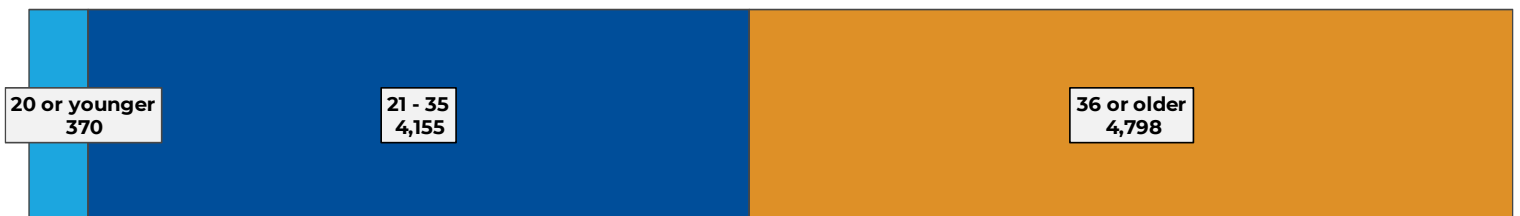
Age Breakdown of Total SoonerPlan Enrollment