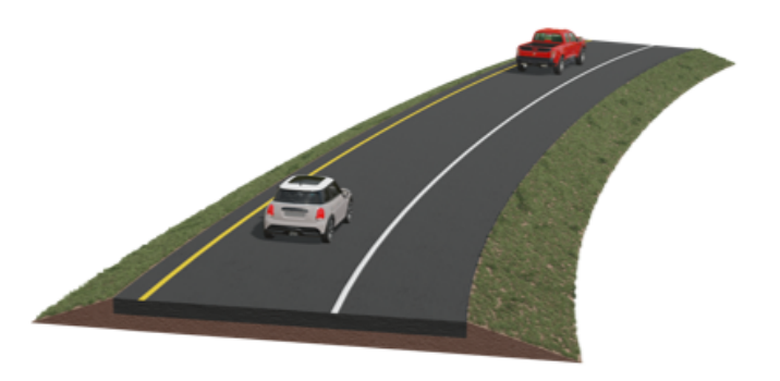
Ramps at US-62