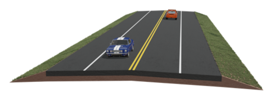
Goodyear Boulevard Main Lanes