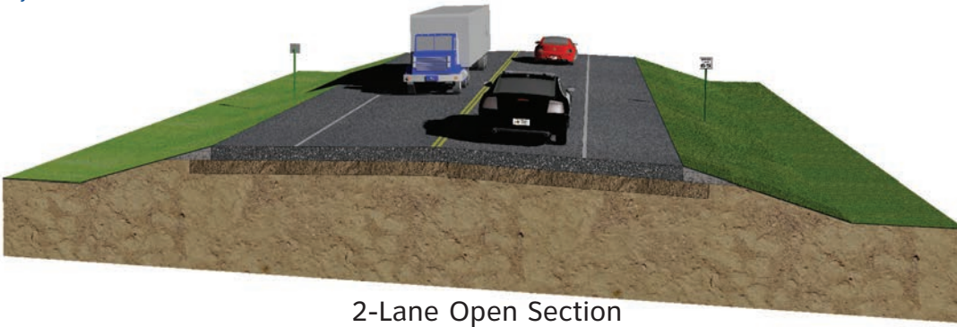
2-Lane Open Section