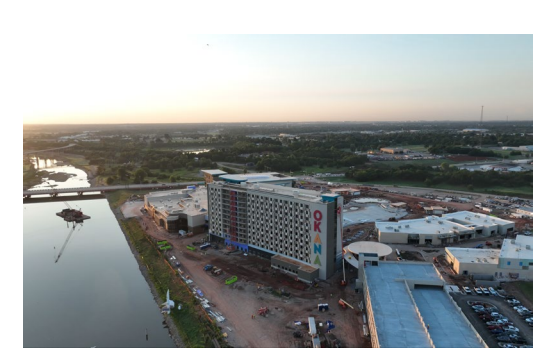
Figure 5: OKANA Resort Site and Rendering

The Project will enhance tourism connectivity between downtown Oklahoma City and the OKANA resort.