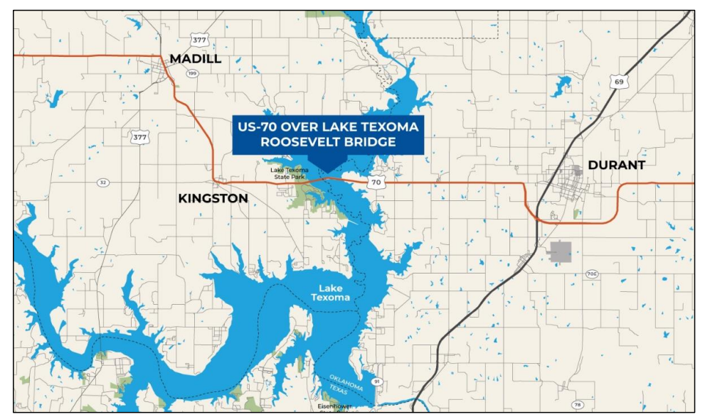
Figure 1: Roosevelt Bridge Location Map