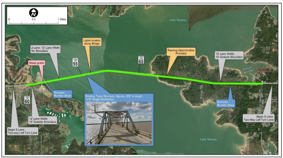
Figure 2: Roosevelt Bridge Project Extents