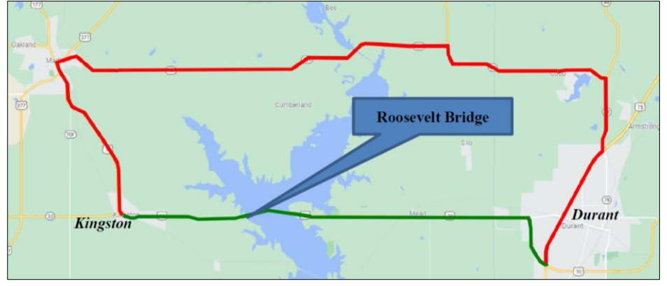
Figure 6: Roosevelt Bridge Detour

Travel time savings will also be realized through the avoidance of detours. As shown in Figure 6 , a closure of the Roosevelt Bridge would result in a detour of approximately 39.1 miles (red and green routes). For the purpose of determining a detour distance, it is assumed the majority of the traffic is travelling a distance at minimum of 17.6 miles between Kingston and Durant (green route), creating a 21.5-mile detour. The impact of detours related to structural degradation assumed the bridge would be load posted to 50% of trucks and buses in 2033. The closest detour to cross Lake Texoma is to use Route 199 to the north. As described above, according to the ODOT State Bridge Engineer, it is likely the existing bridge will require posting and closure in the near term. However, to be conservative, full posting and closure were not included in the analysis period. A sensitivity analysis was included to reflect the earlier posting and closure dates estimated by ODOT. See the Sensitivity Analysis section of this memo.