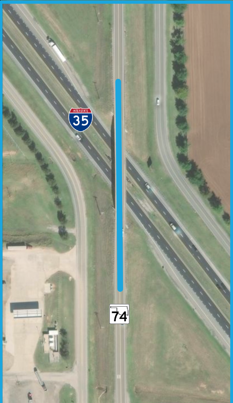
SH-74 Bridge Over I-35 in Goldsby, OK