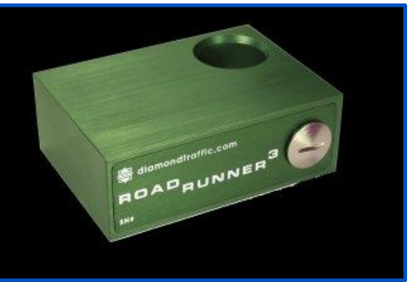
Figure 1. Road Runner 3 used for collecting data

Innovative Traffic Systems & Solutions (ITSS), LLC has developed the TCMS for providing web services. The TCMS is composed of Android applications running on tablets and web services provided by the TCMS server.