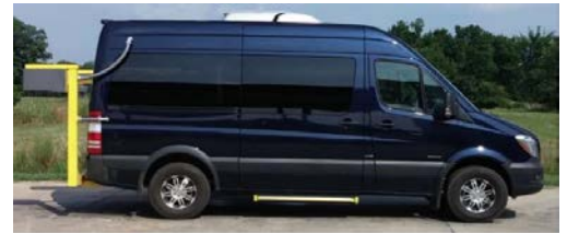
Figure 1 PaveVision3D Ultra

OVERVIEW Accurate and timely information related to pavement surface characteristics is critical for evaluating the performance, condition, and safety of pavement and bridge infrastructure. Typical data collection methods are slow, and because of the presence of traffic, are disruptive and unsafe. Additionally, data sets for surface characteristics generally exhibit poor quality related to consistency, repeatability and accuracy, which can skew subsequent analyses and hinder state agency decision making. With the development of three-dimensional (3D) laser imaging technology, the latest iteration of PaveVision3D Ultra (Figure 1) can obtain true 1 millimeter (mm) resolution 3D data at full-lane coverage at highway speed (up to 60 miles per hour (mph)). This innovative technology facilitates state agency design and management processes, particularly in supplying quality data for pavement management system (PMS), bridge deck evaluation, Pavement Mechanistic-Empirical Design and Highway Performance Monitoring System (HPMS) functions.