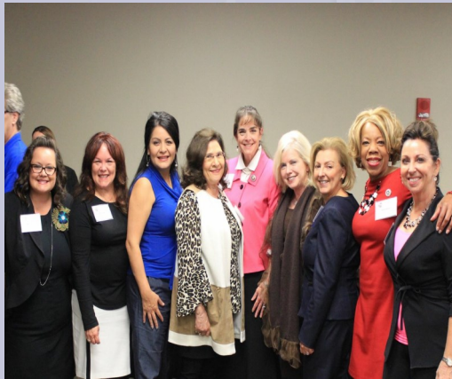
Commissioners attending 2020 Women on Boards event