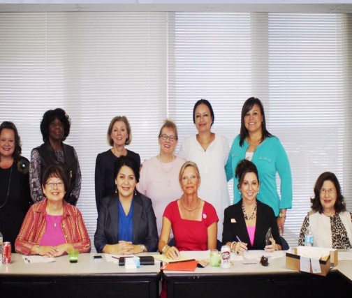
Commissioners and Advisory members attending monthly business meeting