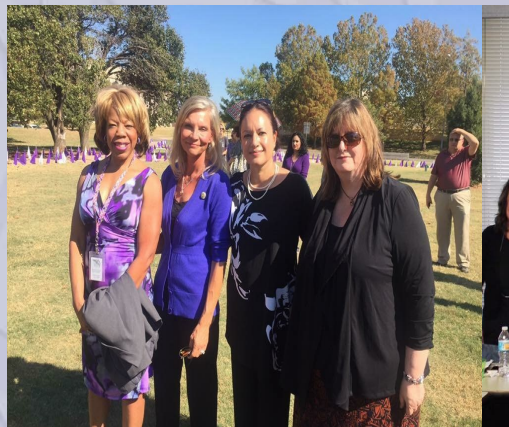
Domestic Violence Awareness Day