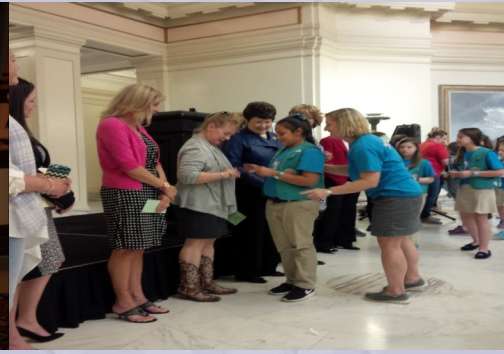
Girl Scout Day at State Capitol, pinning of Honorary Troop 1921