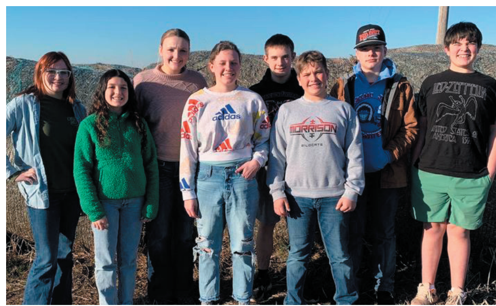
Morrison Junior High Academic Team