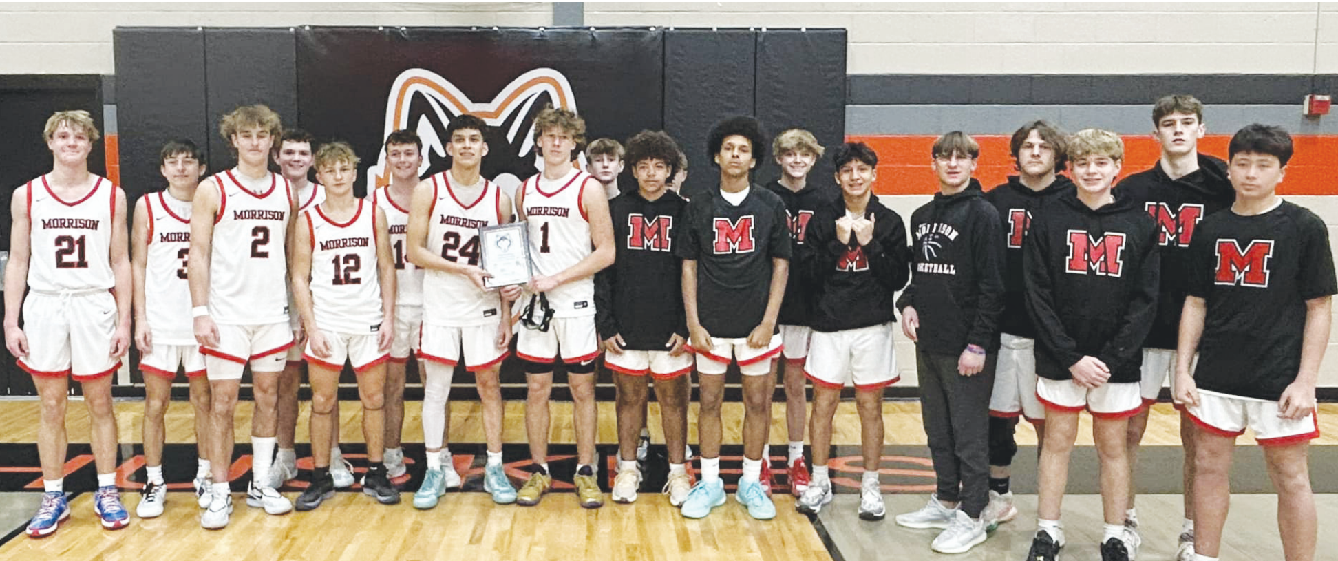
Pawhuska Tournament Runner-Up