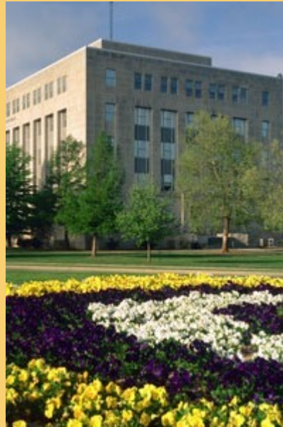
Oklahoma Corporation Commission Public Utility Division Tel: 405-521-4114

For assistance, contact us at (405) 521-4114 or email us at OUSF@occ.ok.gov