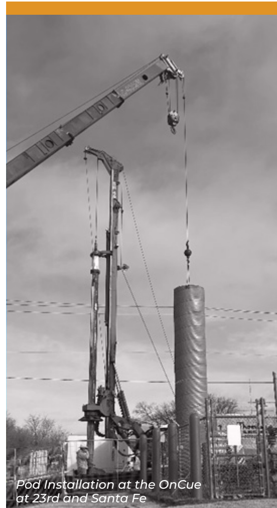
Pod Installation at the OnCue at 23rd and Santa Fe