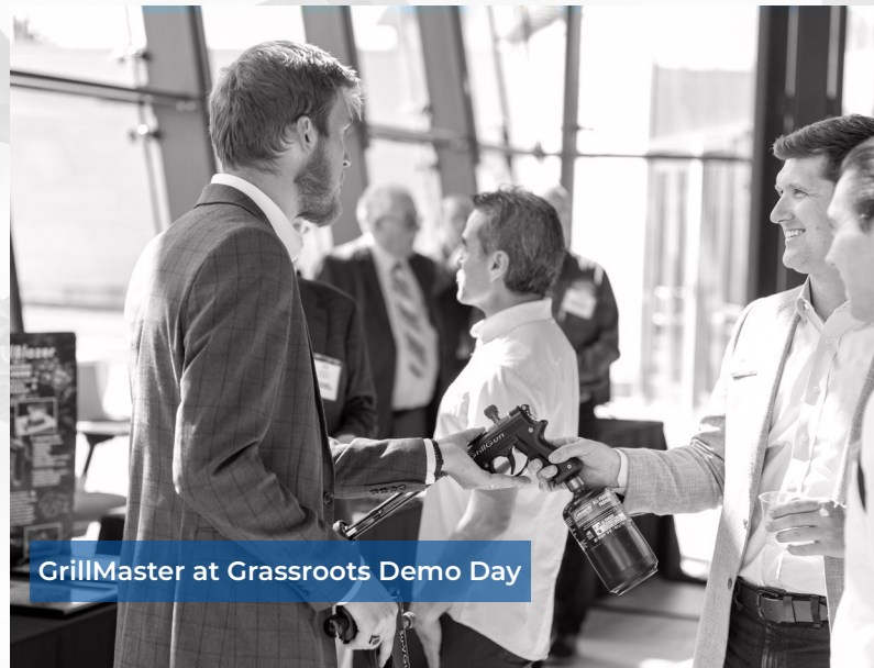
GrillMaster at Grassroots Demo Day

The Oklahoma Grassroots Rural & Ag Business Accelerators program is a collaborative rural development initiative from Oklahoma Farm Bureau along with national and state-level partners that develops Oklahoma-based innovators creating ideas, technologies and products creating economic opportunities in rural Oklahoma.