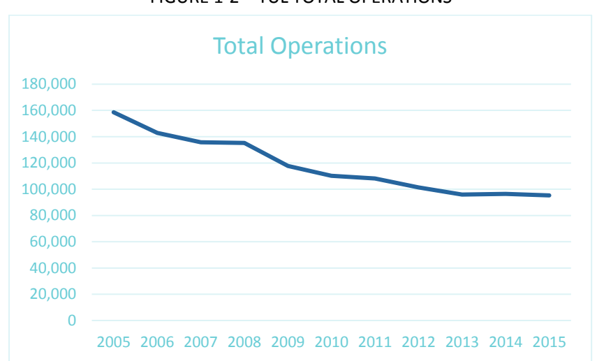
FIGURE 1-2 - TUL TOTAL OPERATIONS