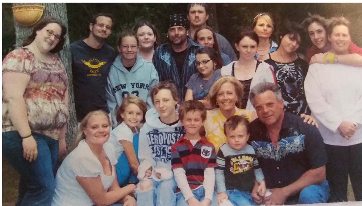
“My family is everything.”