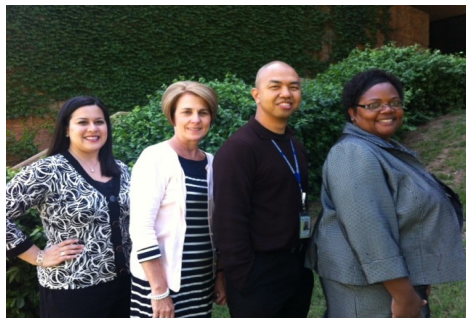
Individuals pictured from Left to Right listed below.

The Newborn Hearing Screening Program (NHSP) wants to introduce our new team, which includes 3 new staff members since last year.