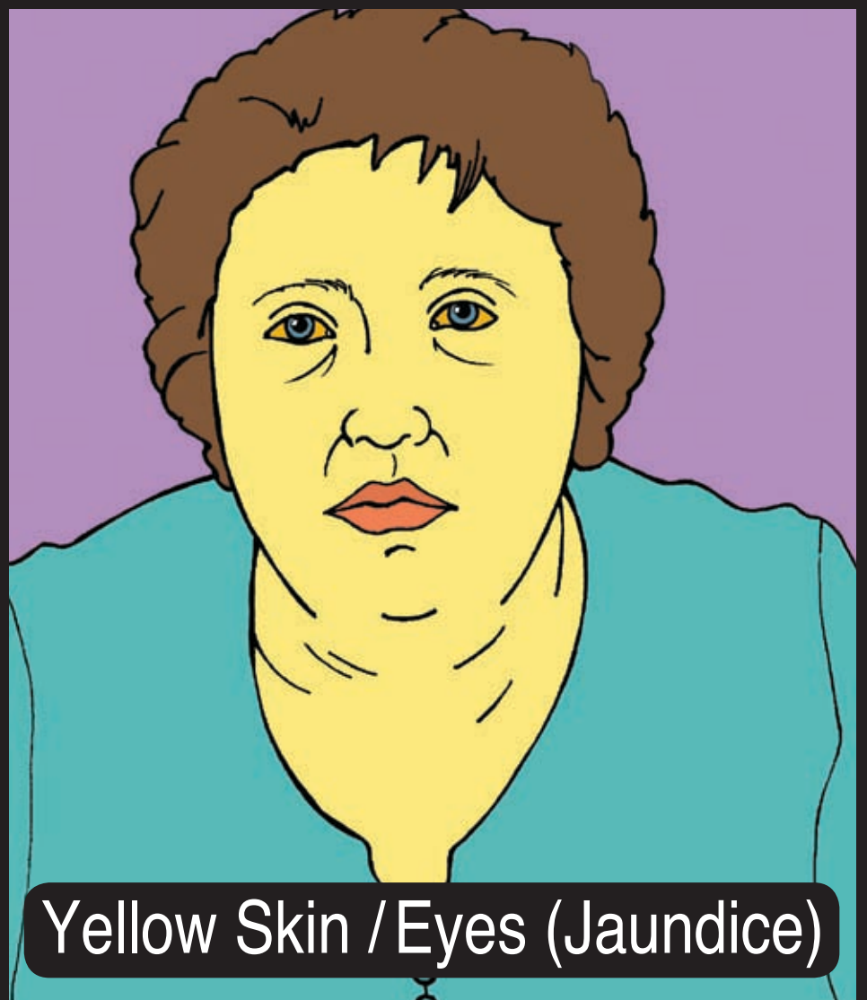
Yellow Skin / Eyes (Jaundice)