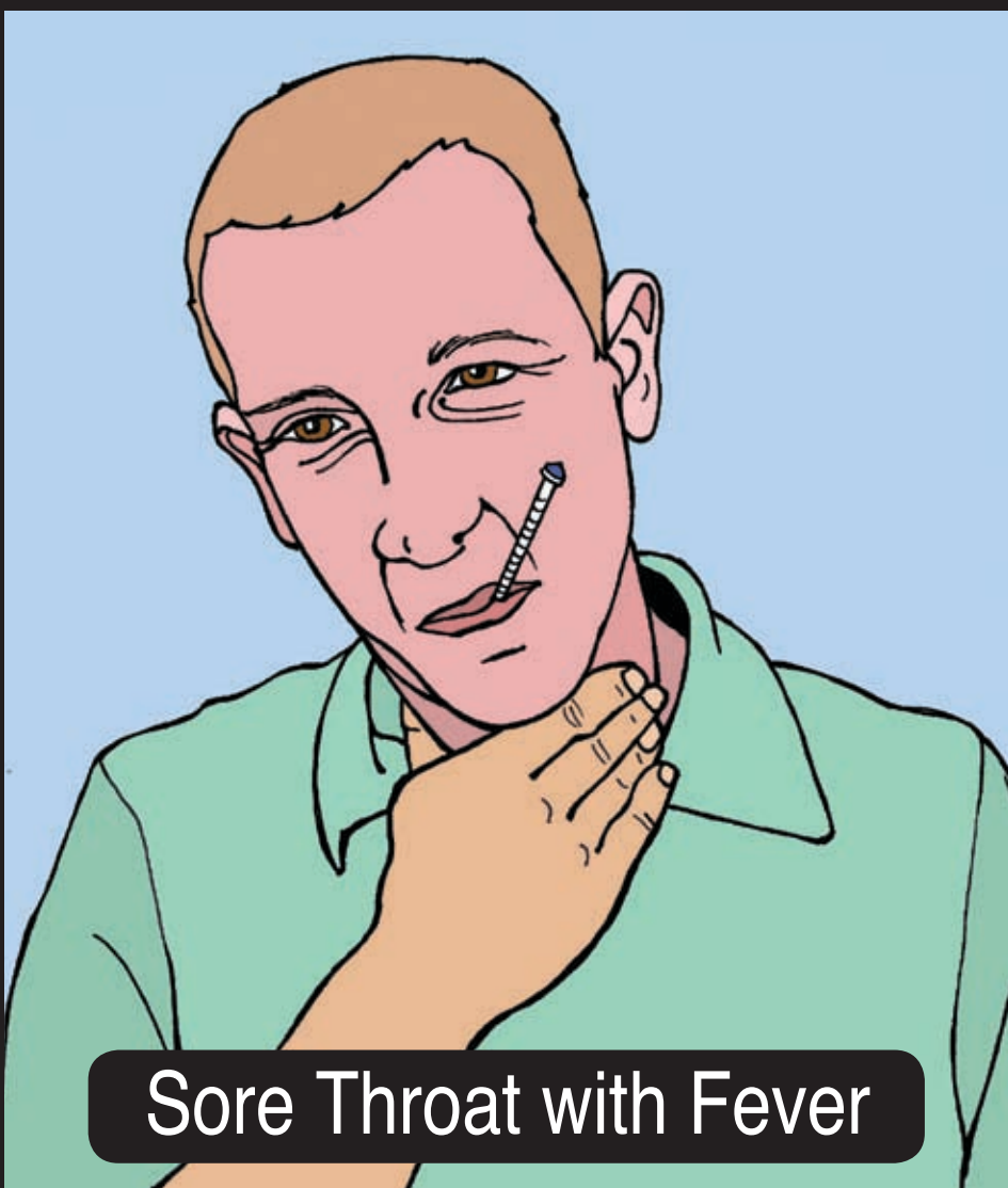
Sore Throat with Fever