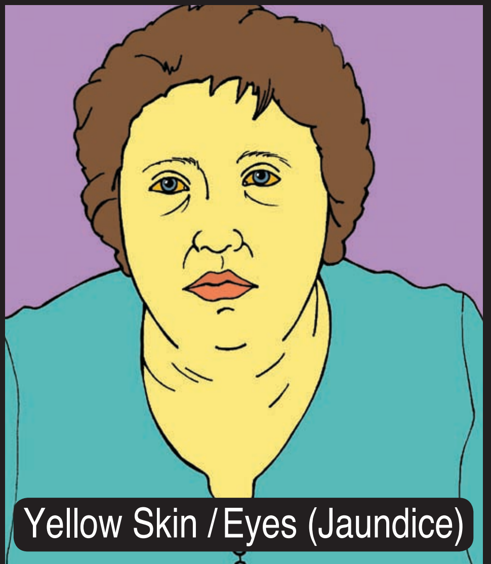
Yellow Skin / Eyes (Jaundice)