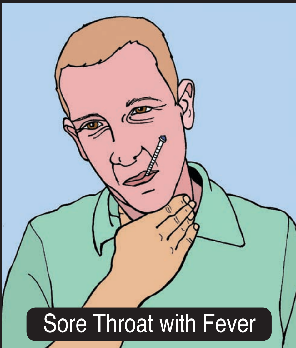
Sore Throat with Fever