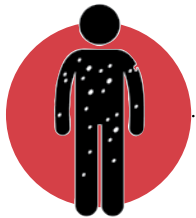
RED HOT SKIN