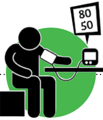
LOW BLOOD PRESSURE