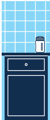
Counter Top or Table