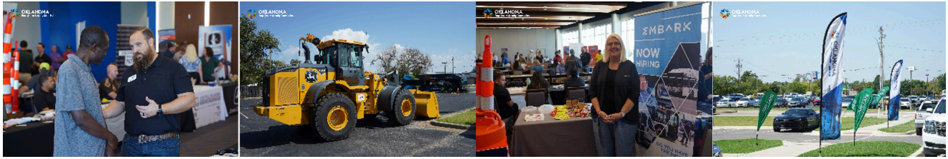
(Pictured: Employers, jobseekers and machinery at the transportation and construction job fair)