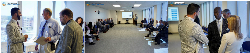
(Pictured: OESC senior staff hosting legislators at agency headquarters, located in the Will Rogers Building)