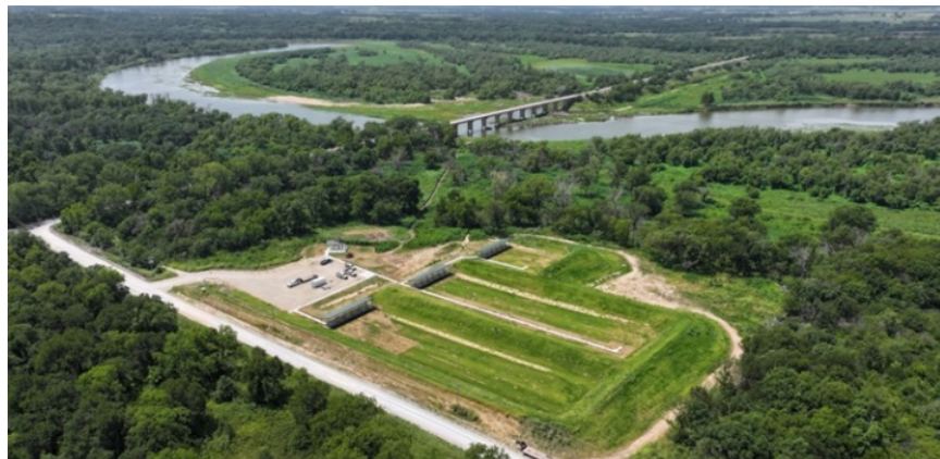
(Picture: In the summer of 2023, the Oklahoma Department of Wildlife Conservation completed construction of a new public shooting range at the Kaw Wildlife Management Area in north central Oklahoma.)