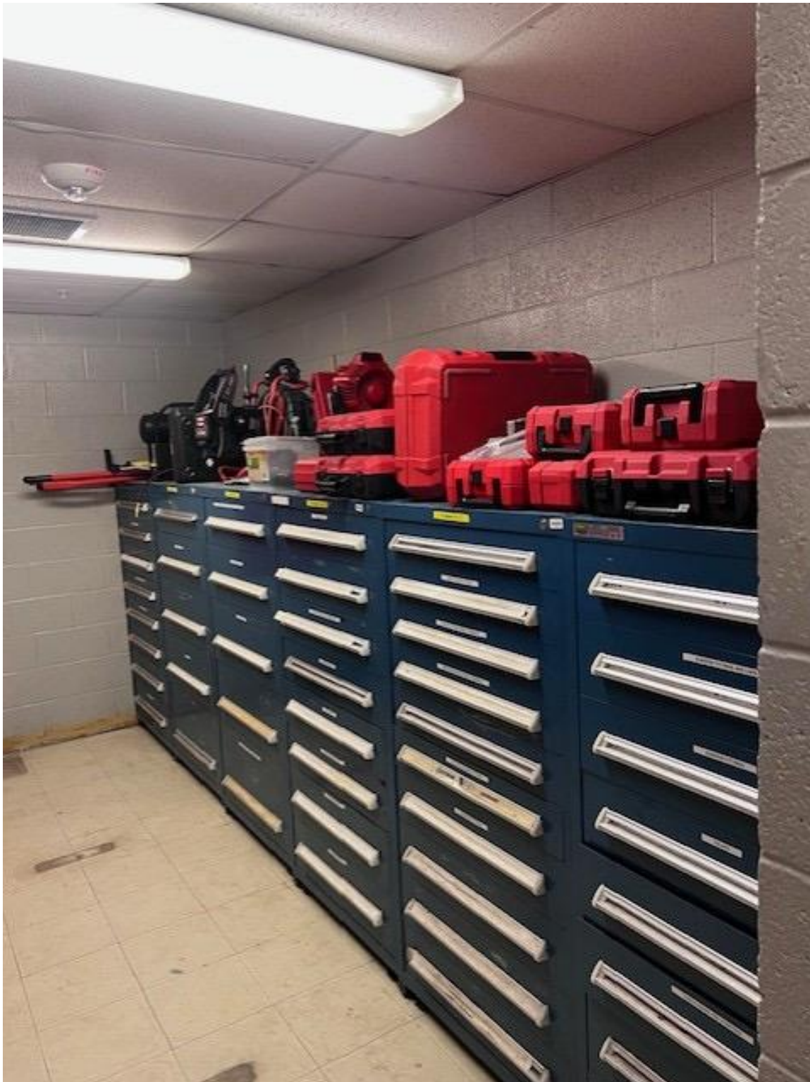
Tool room before the project was completed