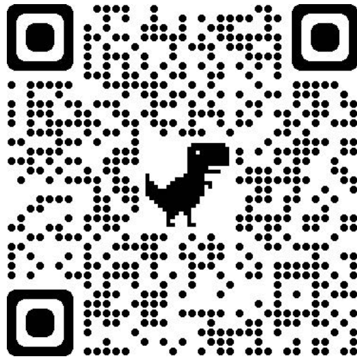
Scan QR Code