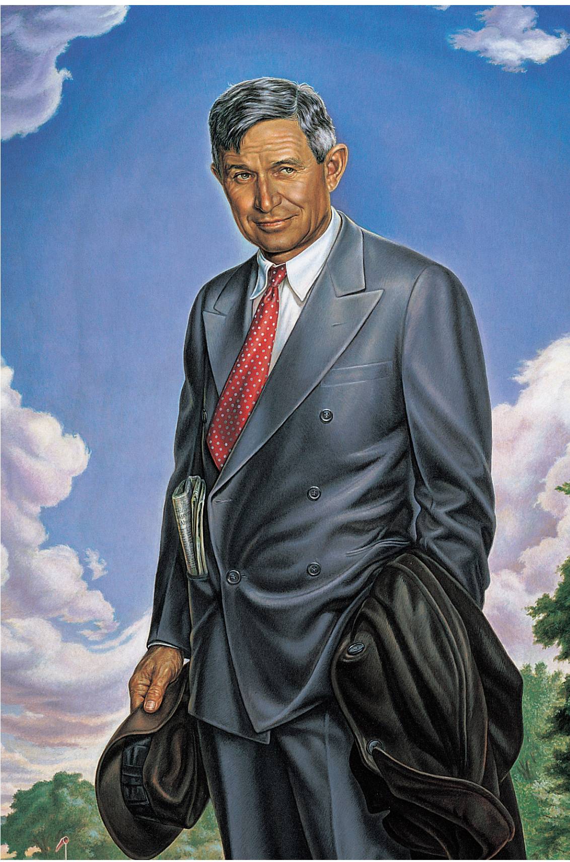
Will Rogers by Charles Banks Wilson