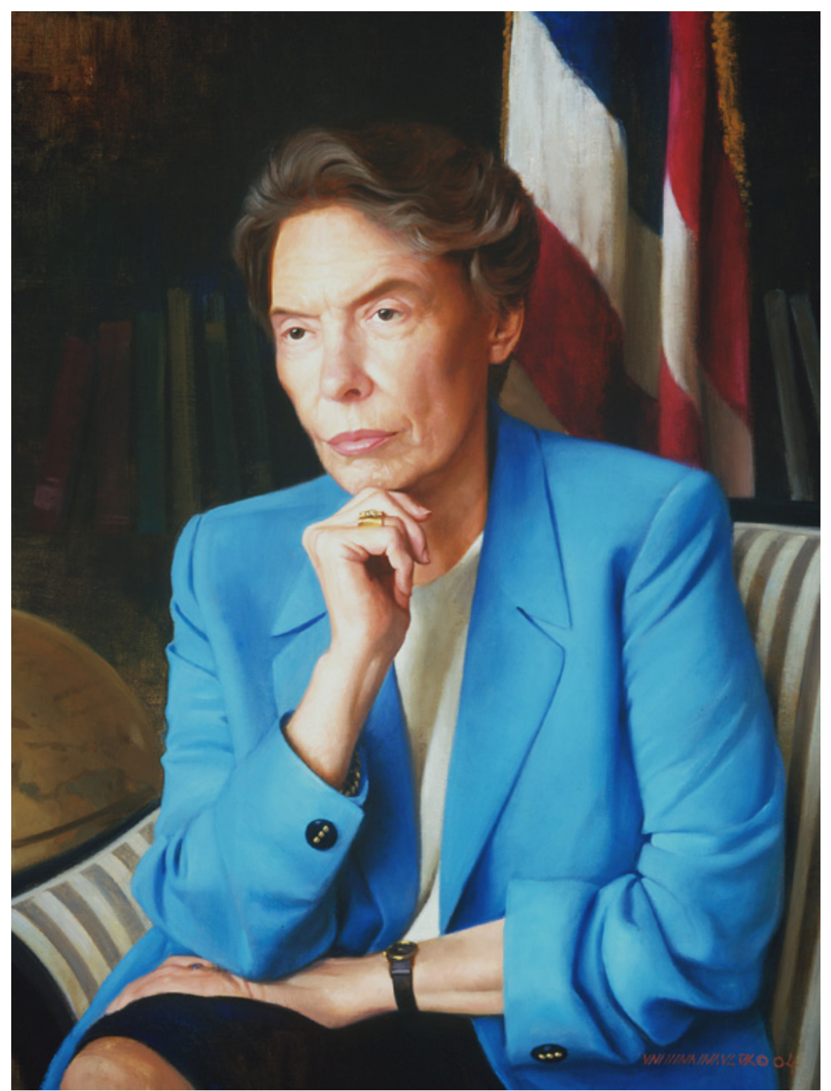
Jeane Kirkpatrick