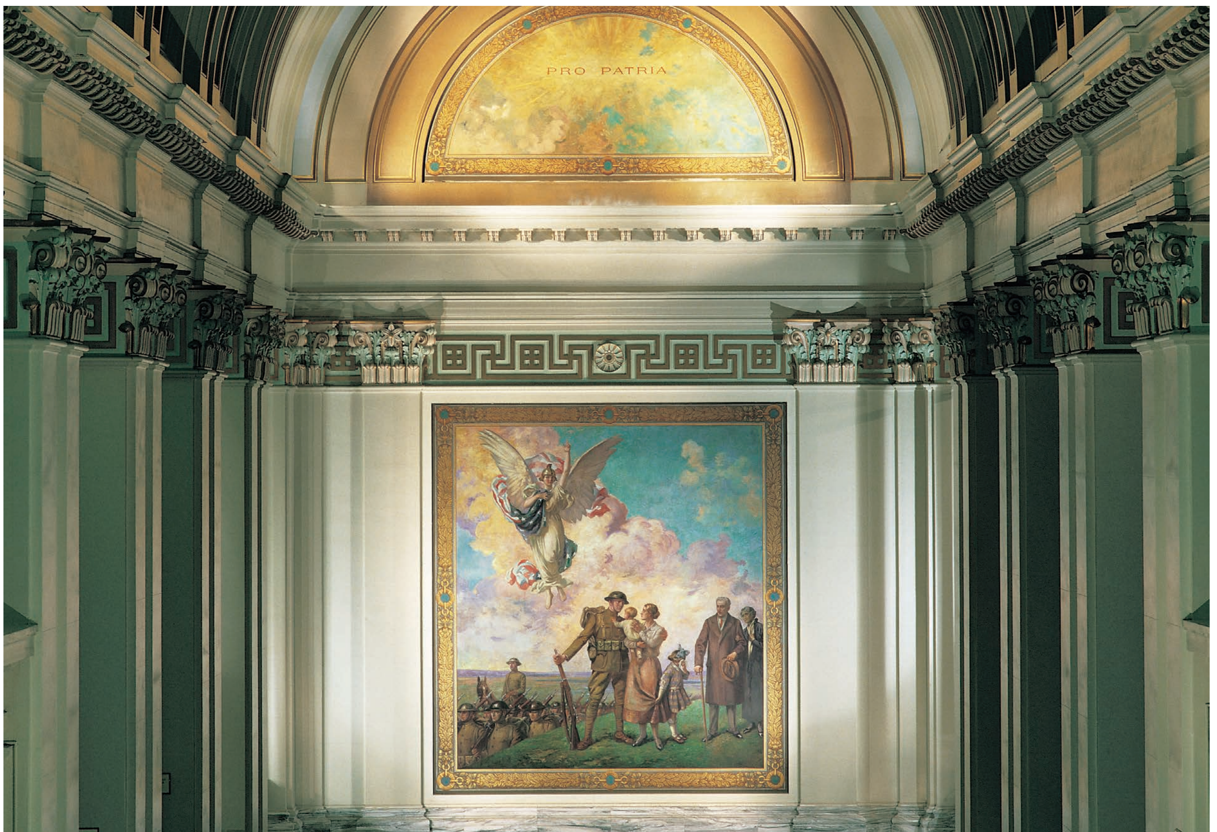
Pro Patria by Thomas Gilbert White