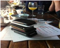
Photo: It's called the Dallas Stack. When out with friends, whoever grabs their blackberry (BB) or e-device first buys dinner for everyone. In a recent lecture it was noted that 32 people out of 39 were texting while the guest speaker was showing a power point presentation.

In today's world our connection to our family and work is dominated by electronics. It has become commonplace to stay checked in at all times. However, this is one creative solution to reconnect to the table.