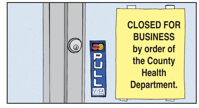
I did not mean to make anyone sick. Now, because of the germs on my hands, someone may die.

Protect People Everywhere. Wash your hands thoroughly and at the proper times. Don't touch ready-to-eat food with your bare hands.