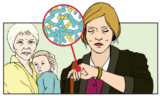
I had to go to work or risk losing my job.