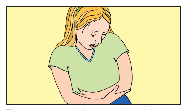
The next day, people that I served complained about being sick with vomiting and diarrhea.