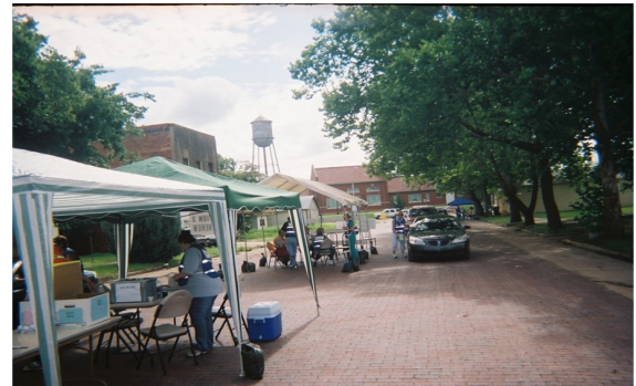
Jefferson County emergency preparedness exercise in Waurika.

City of Waurika Concerned Citizens Faith Community Jefferson County Board of Health Jefferson County Department of Human Services Jefferson County Health Department Jefferson County Hospital OESC/Workforce Oklahoma Department of Human Services Oklahoma Healthcare Authority OSU Extension Ringling Library Smart Start Waurika Library Waurika News Democrat Waurika Schools Wichita Mountains Prevention Network Women's Haven