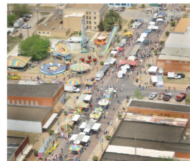
Annual Rattlesnake Hunt in Waurika.

discuss needs and develop a plan of action. The Coalition meets on the 4th Monday of each month at 12:00 noon at the Jefferson County Health Department, 107 East Anderson in Waurika.