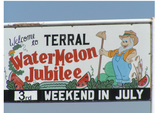
The Annual Melon Jubilee in Terral.

The coalition is working together to make a difference in the health and lives of Jefferson County residents.